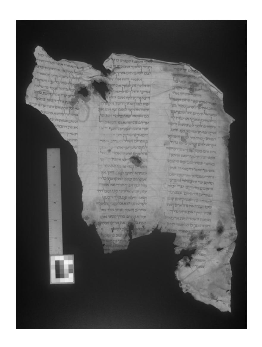
Plate 1: Ashkar-Gilson Hebrew Manuscript #21 David M. Rubenstein Rare Book & Manuscript Library, Duke University